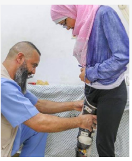
The Little Wings Foundation Creating Opportunities for Children in the Region