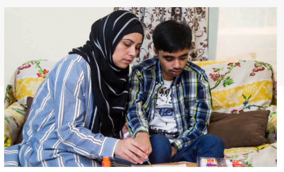
Ta'alouf Empowering Children of Determination