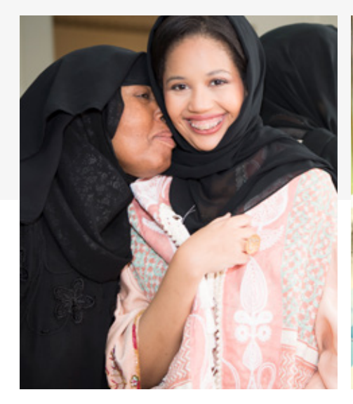
A'awen Saving Lives of Patients

Facilitate quality medical care for patients suffering from chronic illnesses to alleviate the financial burden of those in need.