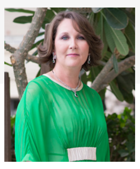
Brest Friends Giving Hope to Breast Cancer Patients